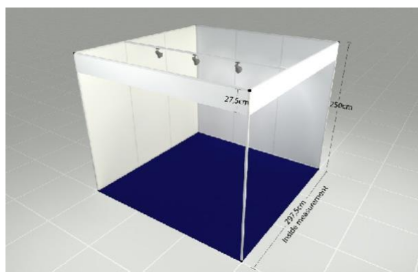
Example of a 9 m 2 booth with buildup