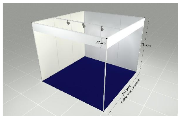
Example of a 9 m 2 booth with buildup